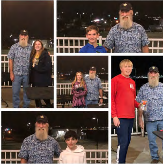
Sailing Team Banquet