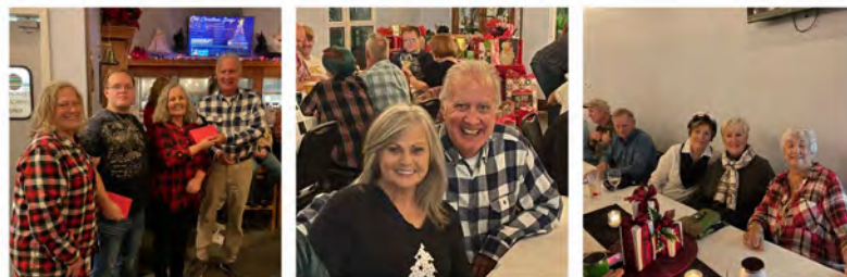
Christmas Party fun