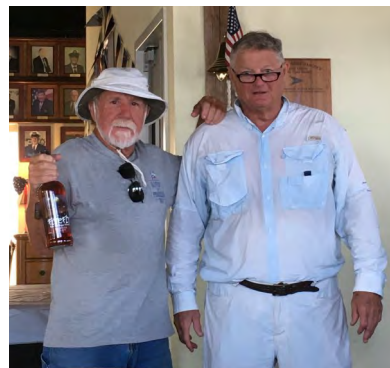
3rd Place Free Spirit