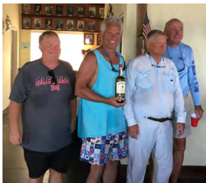
1st Place Ardent Star