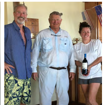
4th Place Valkyrie Haven