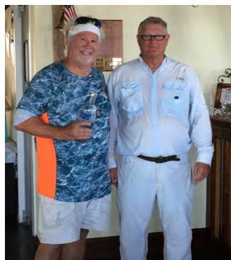
2nd Place 'Dat Yat