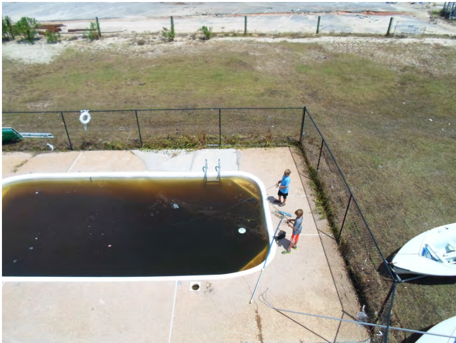
Apparently, there was good fishing in the swimming pool