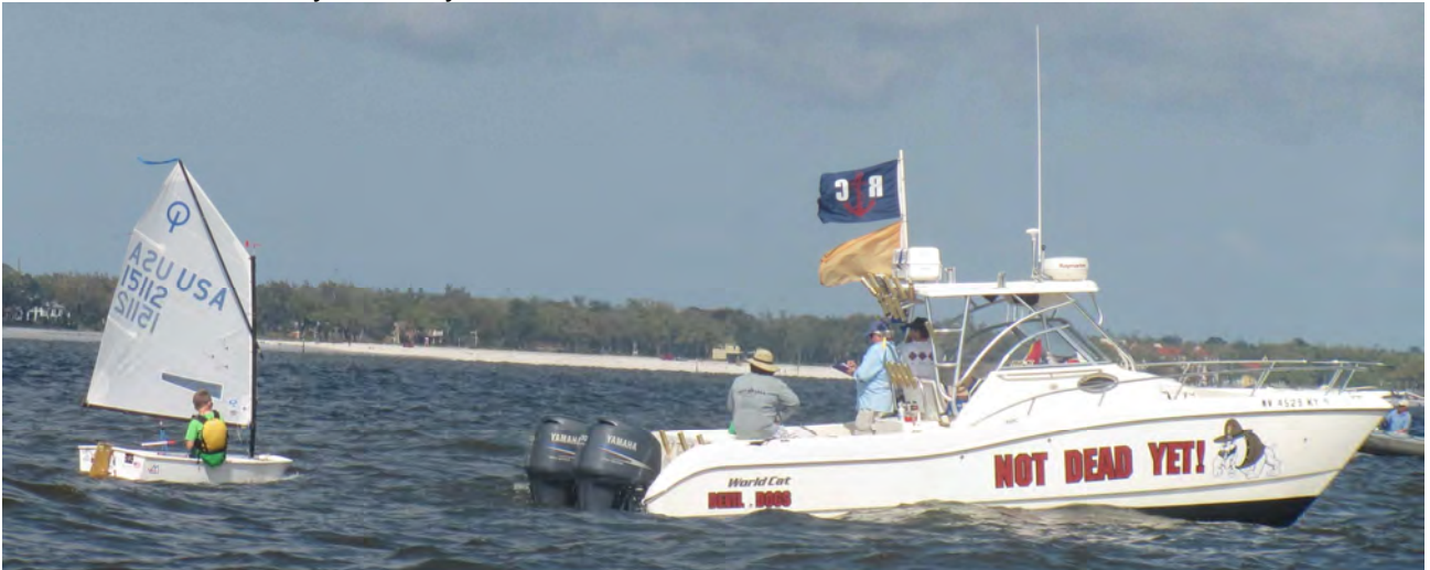
Rickey starting a race