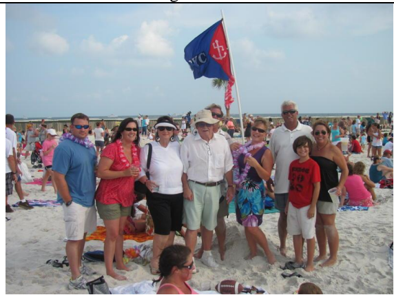
LBYC is well represented