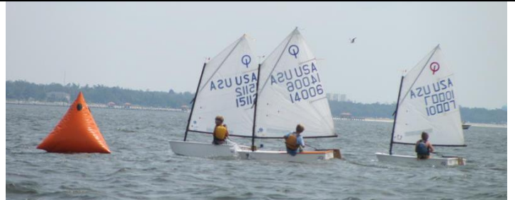
Rounding the Mark