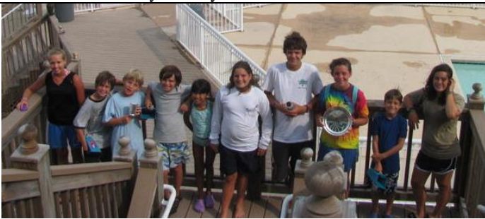
Juniors at the Gulfport Yacht Club