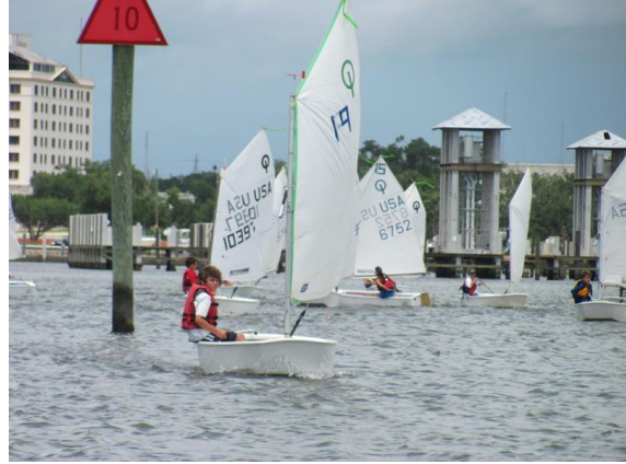
Leaving Gulfport Harbor