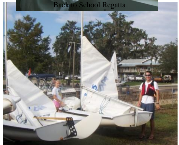
Back to School Regatta