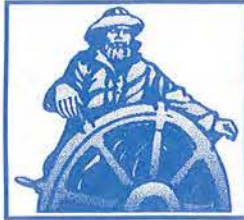
FROM THE BRIDGE