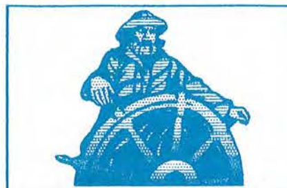
FROM THE BRIDGE

I have listened to many comments in recent days regarding the assessment and minimum billing adopted by the Board and set to begin on 1 October 1995. Two main themes have been expressed. One group asks why if they pay dues in a timely manner and do not use the Club should they be asked to spend $20 per month to otherwise support the Club. When asked how to stabilize the finances at the Club, their answer is to cut employees, cut services, close the Club more often, close the food service and lessen building maintenance.