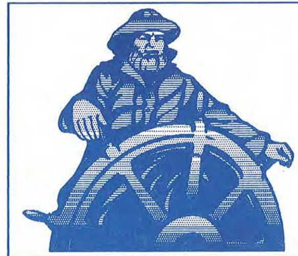
FROM THE BRIDGE

As many of you are aware, the Board of Governors have been meeting in special session during the month of August. These meetings are for the single purpose of addressing the current financial condition of the LBYC. Many ideas have been presented to increase revenue at the Club. As of this writing, no decisions have been made as to how this