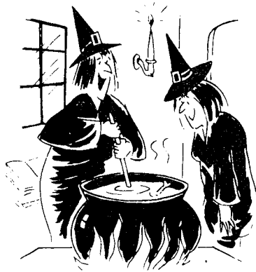
"Where's the beef?!"