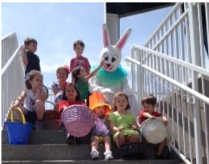
Did we mention we LOVE families?