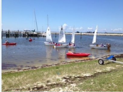
Another sailing class gets underway!